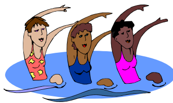
WATER AEROBICS & MORE...